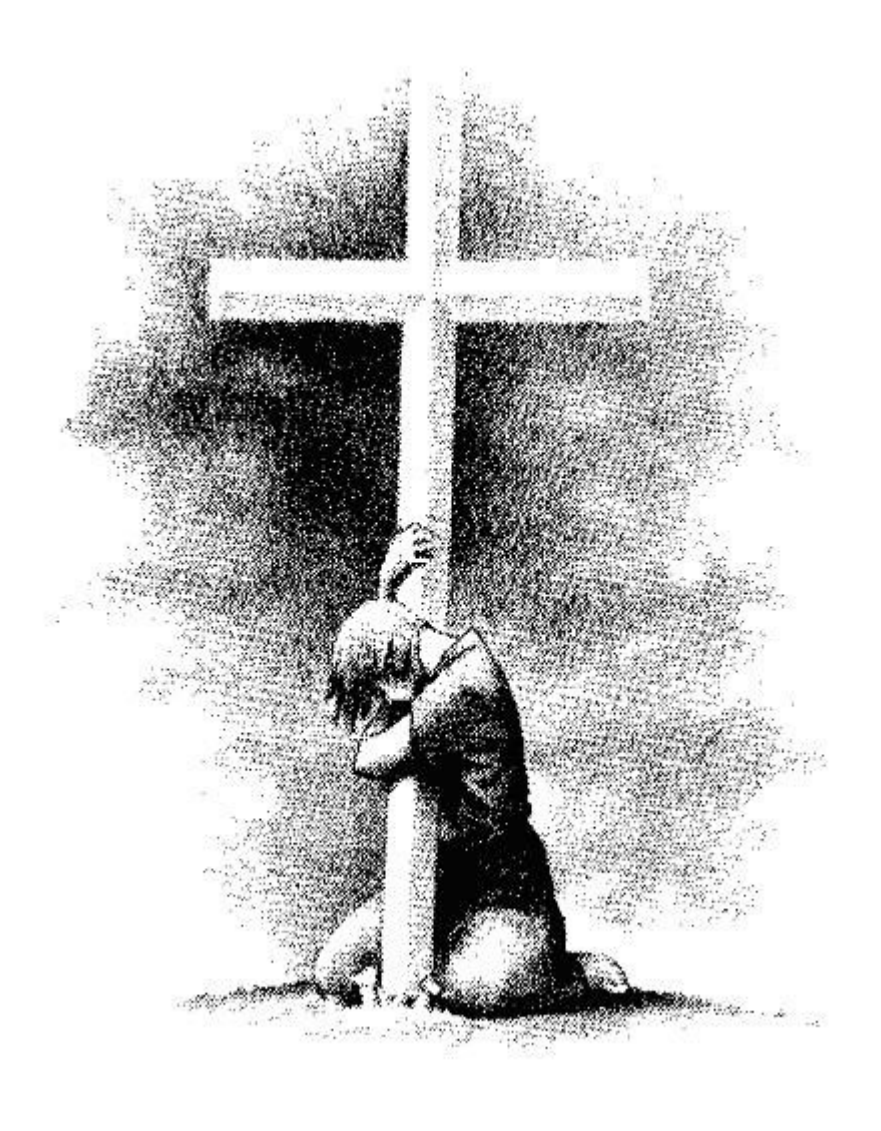
Faith Lutheran Church Sunday - June 11<sup>th</sup> 2023