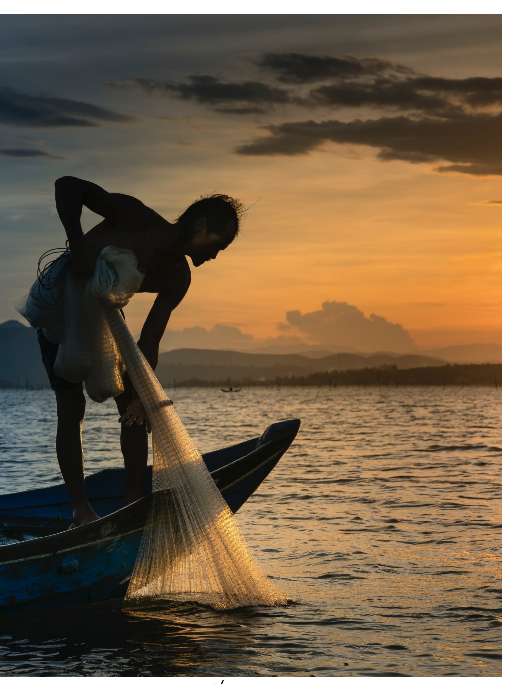
February 6<sup>th</sup> 2021