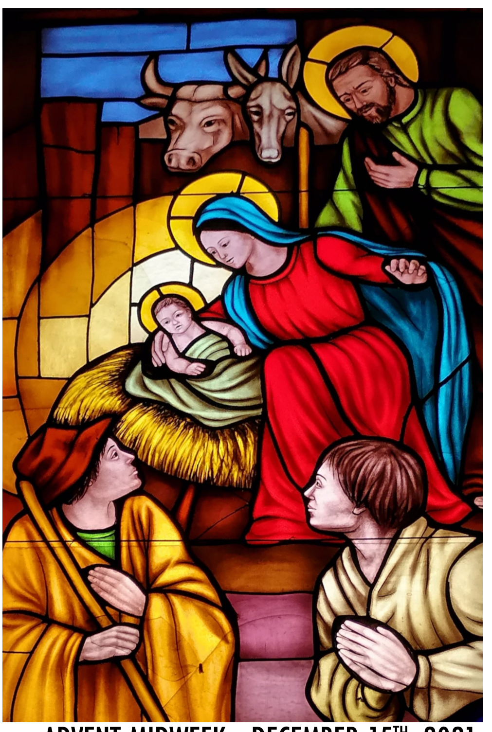
ADVENT MIDWEEK - DECEMBER 15<sup>TH</sup>, 2021