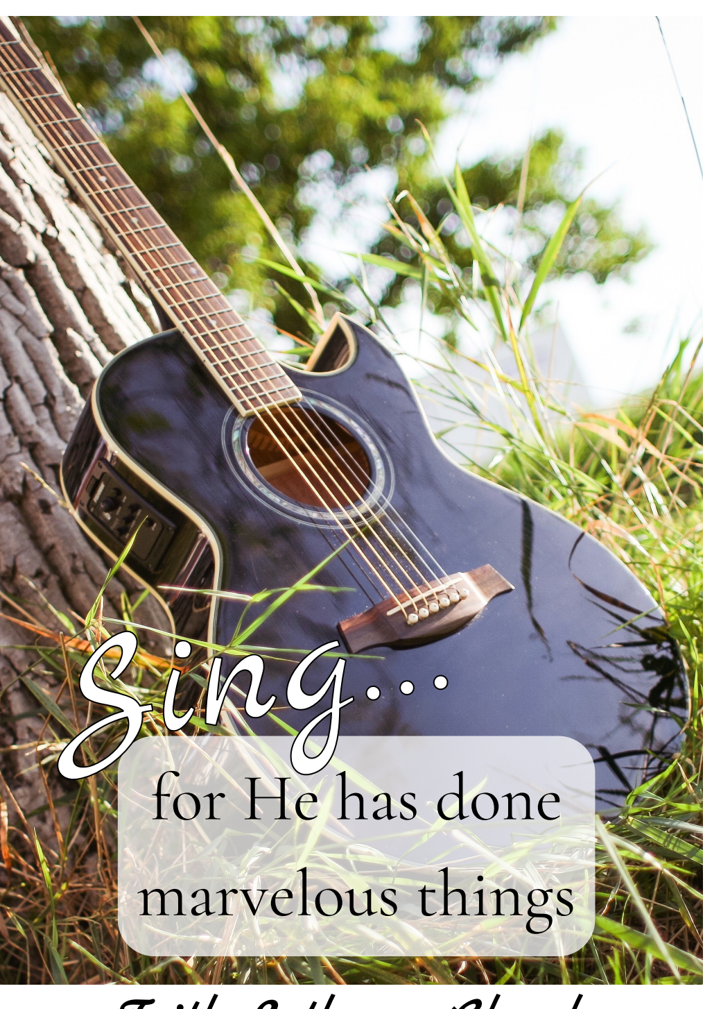
Faith Lutherap Church July 11<sup>th</sup> 2021