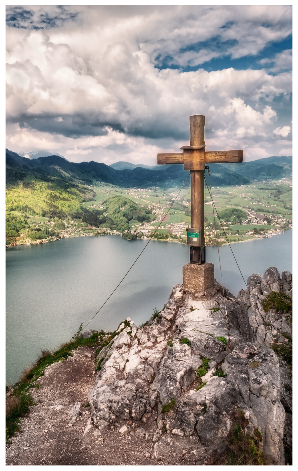
July 28th, 2019