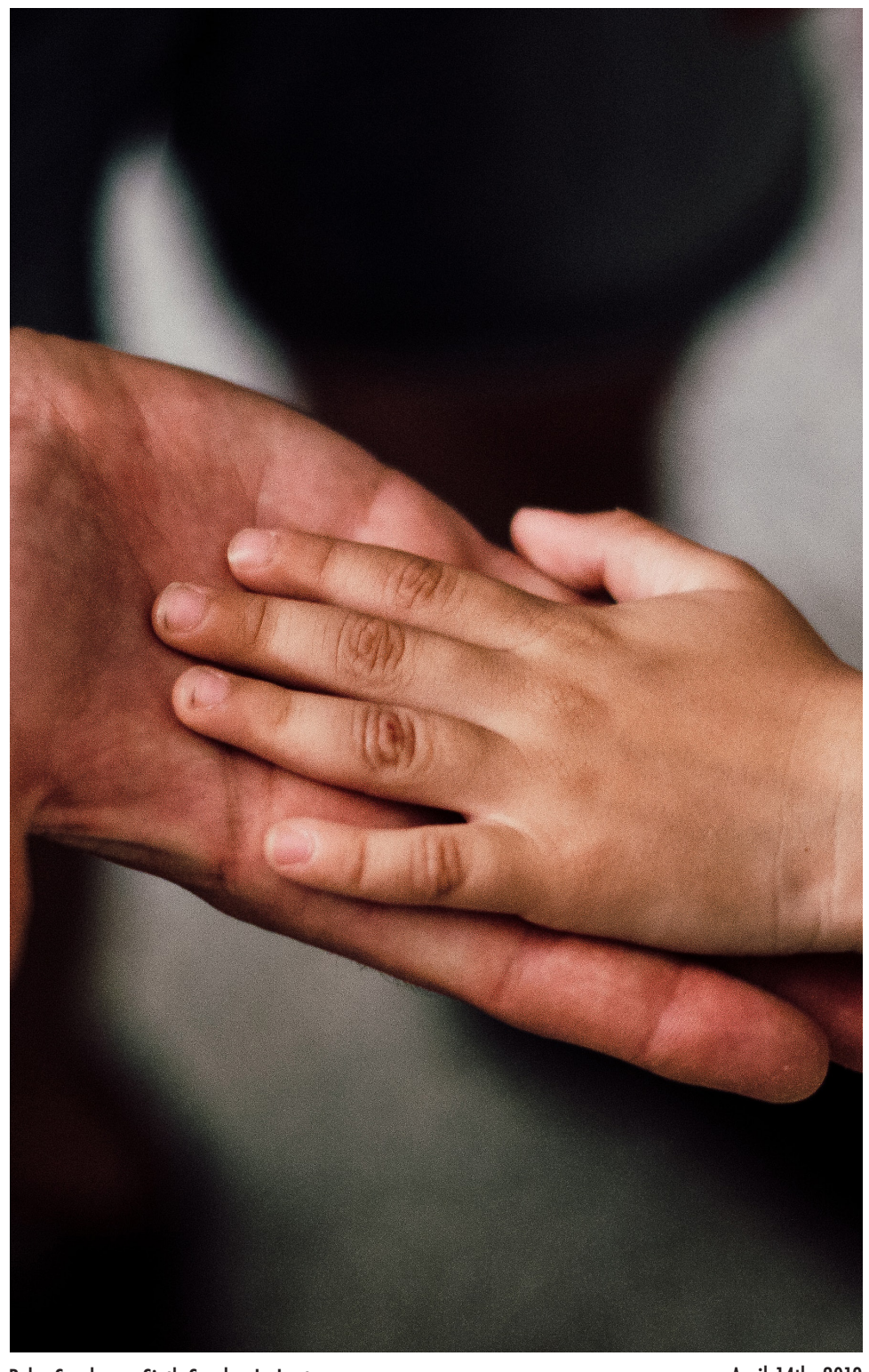
{\bf Palm\ Sunday\ -\ Sixth\ Sunday\ In\ Lent}